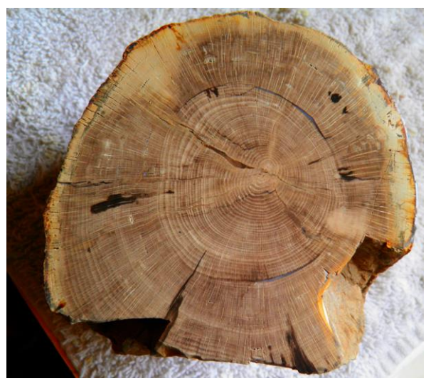
Good Specimens dug in years past at The Old Marker Ranch