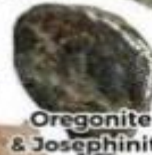
Oregonite & Josephinite