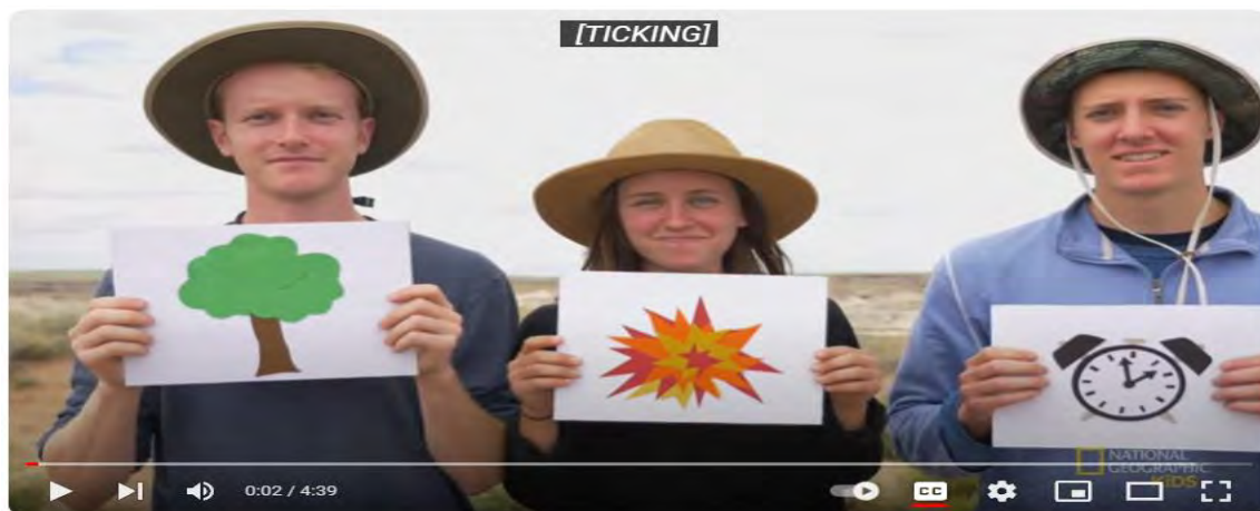
Petrified Forest National Park | Nature Boom Time

https://www.youtube.com/watch?v=rt7p6s6IKSk&t=2s